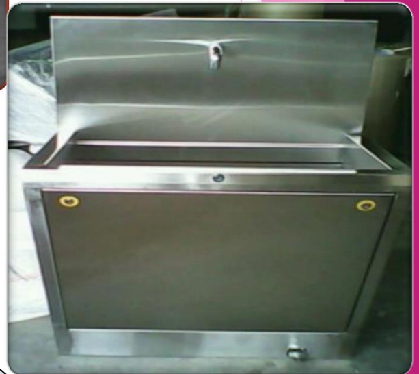
CR SS001SF (Sensor + Foot Operated with Thermostatic Mixer)