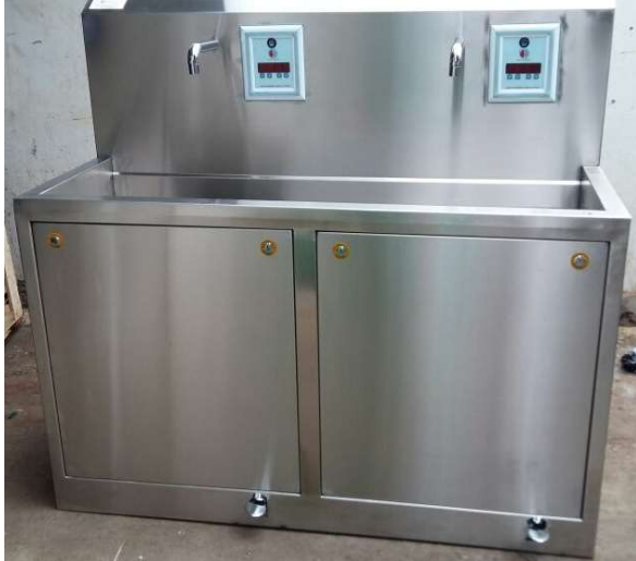
2 BAY- CR SS002SF (Sensor+ Foot Operated with Thermostatic Mixer)