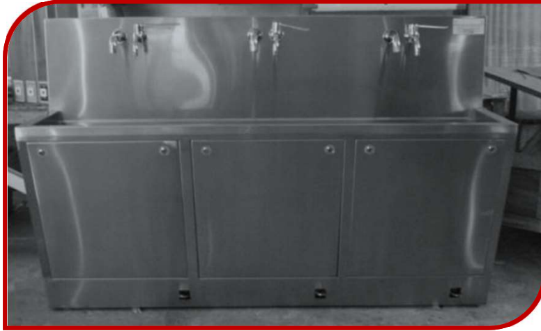
3 BAY- CR SS003FE (Foot + Elbow Operated with Thermostatic Mixer)