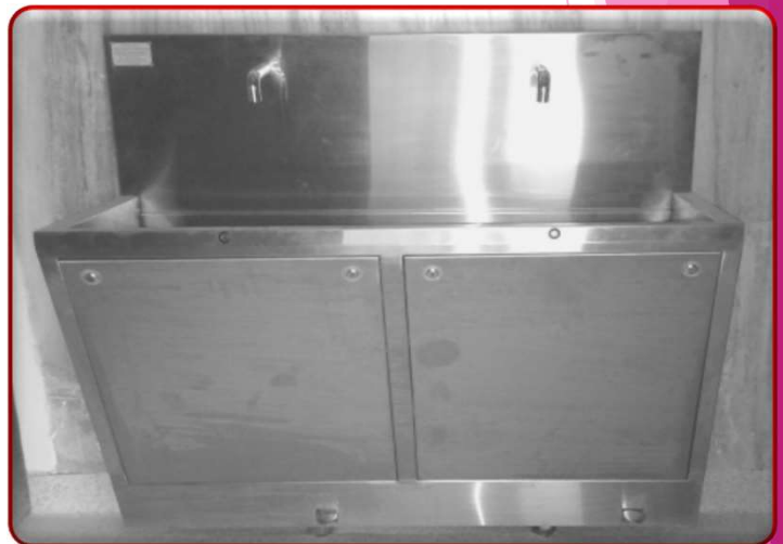
2 BAY- CR SS002F (Foot Operated with Thermostatic Mixer)