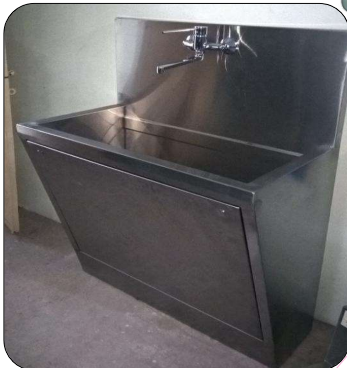
CR SS001EM (Elbow Mixer Operated)