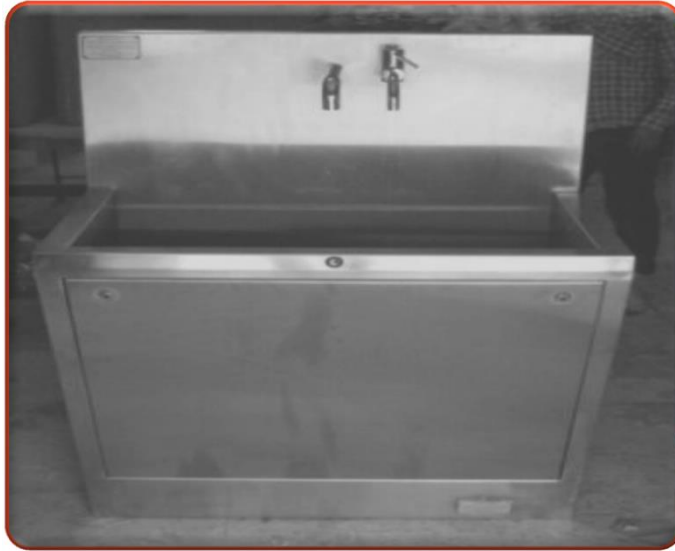
CR SS001SE (Sensor + Elbow Operated with Thermostatic Mixer)