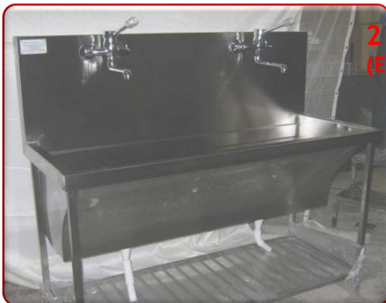
2 BAY- CR SS002EM (Elbow Mixer Operated)